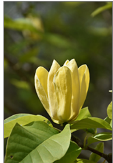
Yellow Bird Magnolia flowers