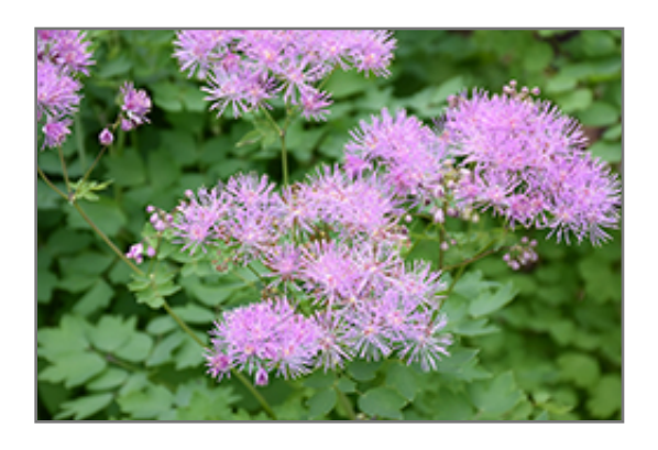
Meadow Rue flowers