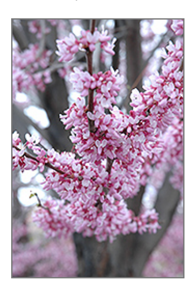
Eastern Redbud flowers

BRUNSWICK 422 Bath Road Brunswick, ME 04011 1-800-339-8111 207-442-8111