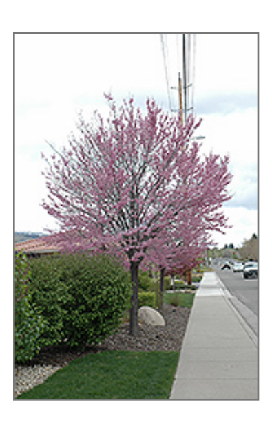
Eastern Redbud in bloom