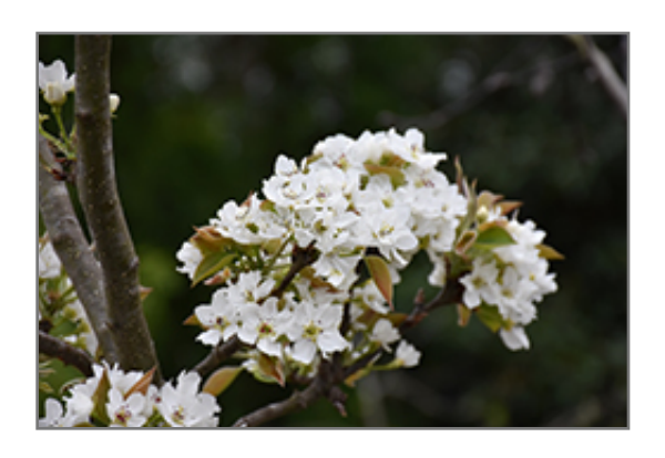
20th Century Pear flowers