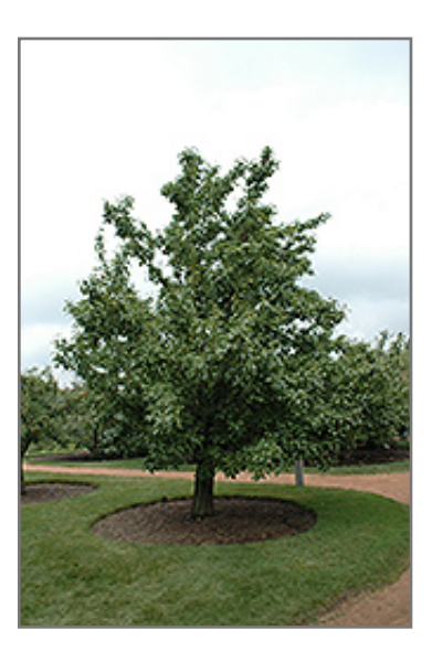
20th Century Pear

20th Century Pear will grow to be about 35 feet tall at maturity, with a spread of 25 feet. It has a low canopy with a typical clearance of 5 feet from the ground, and should not be planted underneath power lines. It grows at a fast rate, and under ideal conditions can be expected to live for 50 years or more. This variety requires a different selection of the same species growing nearby in order to set fruit.