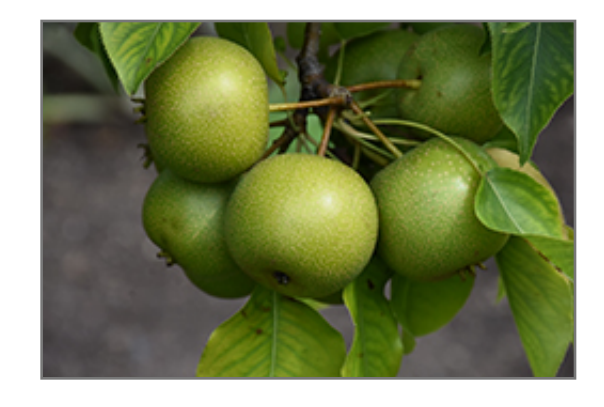
20th Century Pear fruit

20th Century Pear is clothed in stunning clusters of white flowers with purple anthers along the branches in early spring before the leaves. It has dark green deciduous foliage. The glossy pointy leaves turn an outstanding tomato-orange in the fall. The fruits are showy yellow pears with hints of red, which are carried in abundance in late summer. The fruit can be messy if allowed to drop on the lawn or walkways, and may require occasional clean-up.