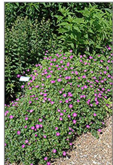
Max Frei Cranesbill in bloom

BRUNSWICK 422 Bath Road Brunswick, ME 04011 1-800-339-8111 207-442-8111