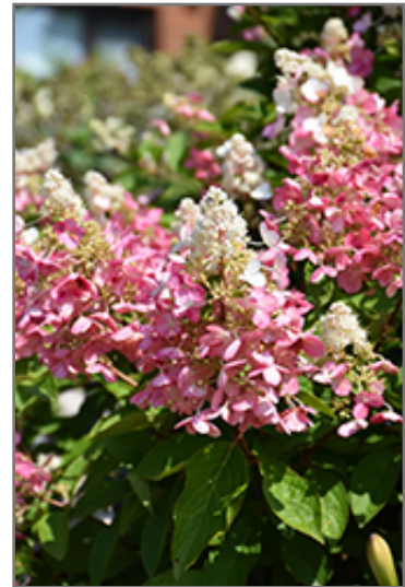
Flare Hydrangea flowers

Flare Hydrangea will grow to be about 3 feet tall at maturity, with a spread of 3 feet. It tends to fill out right to the ground and therefore doesn't necessarily require facer plants in front. It grows at a medium rate, and under ideal conditions can be expected to live for 40 years or more.