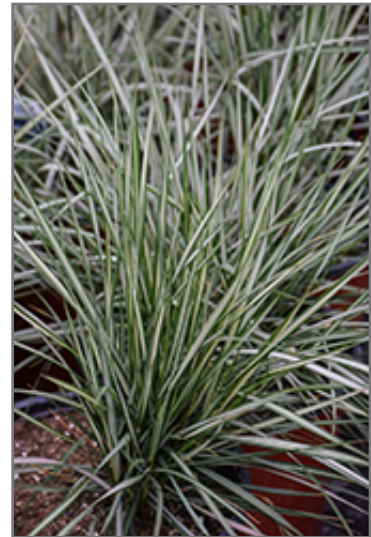
Lightning Strike Variegated Reed Grass foliage

Dramatic purple-pink plumes rising above creamy white foliage with green margins make an appearance in the early summer months; looks wonderful in fresh or dried flower arrangements, borders, or garden landscapes; drought tolerant once established