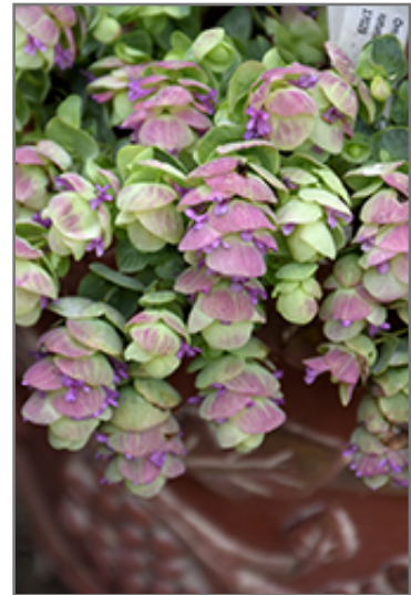
Kirigami Oregano flowers

Kirigami Oregano is recommended for the following landscape applications;