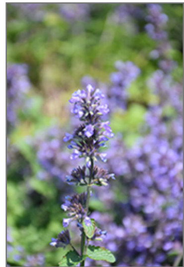
Cat's Pajamas Catmint flowers

Cat's Pajamas Catmint is recommended for the following landscape applications;