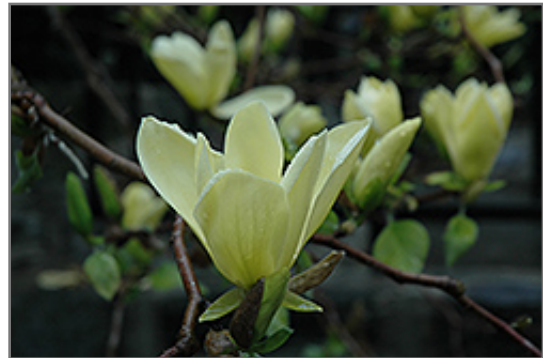
Golden Gift Magnolia flowers

Golden Gift Magnolia will grow to be about 25 feet tall at maturity, with a spread of 20 feet. It has a low canopy with a typical clearance of 2 feet from the ground, and is suitable for planting under power lines. It grows at a medium rate, and under ideal conditions can be expected to live for 50 years or more.