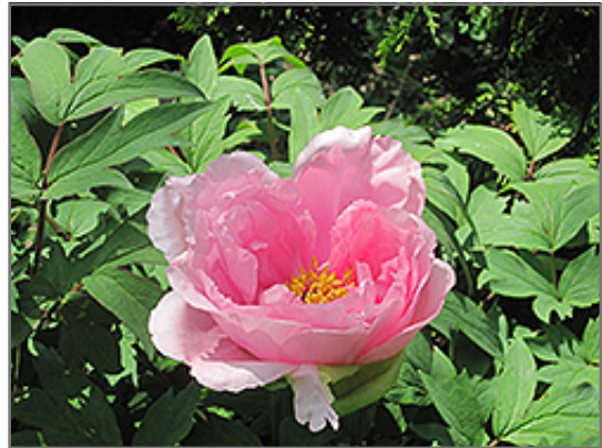
Hanakiso Tree Peony flowers

Hanakiso Tree Peony will grow to be about 5 feet tall at maturity, with a spread of 6 feet. It has a low canopy, and is suitable for planting under power lines. It grows at a slow rate, and under ideal conditions can be expected to live for 50 years or more.