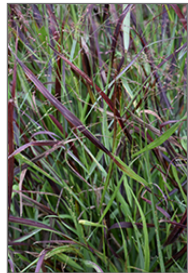
Cheyenne Sky Switch Grass flowers

BRUNSWICK 422 Bath Road Brunswick, ME 04011 1-800-339-8111 207-442-8111