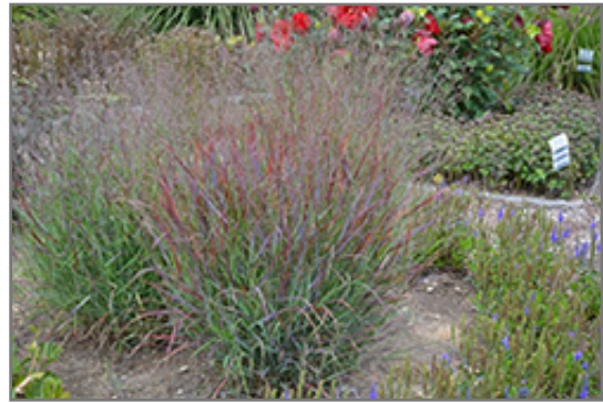
Cheyenne Sky Switch Grass

Cheyenne Sky Switch Grass is recommended for the following landscape applications;