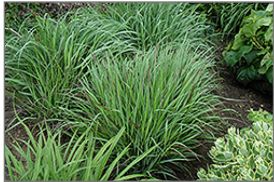
Cheyenne Sky Switch Grass

Cheyenne Sky Switch Grass will grow to be about 24 inches tall at maturity extending to 3 feet tall with the flowers, with a spread of 24 inches. It tends to be leggy, with a typical clearance of 1 foot from the ground, and should be underplanted with lower-growing perennials. It grows at a medium rate, and under ideal conditions can be expected to live for approximately 15 years. As an herbaceous perennial, this plant will usually die back to the crown each winter, and will regrow from the base each spring. Be careful not to disturb the crown in late winter when it may not be readily seen!