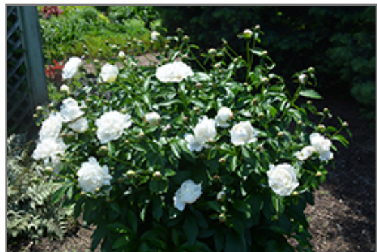
Festiva Maxima Peony in bloom

BRUNSWICK 422 Bath Road Brunswick, ME 04011 1-800-339-8111 207-442-8111