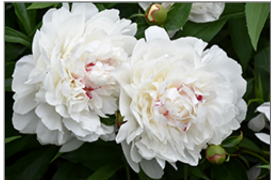
Festiva Maxima Peony flowers

Festiva Maxima Peony is recommended for the following landscape applications;