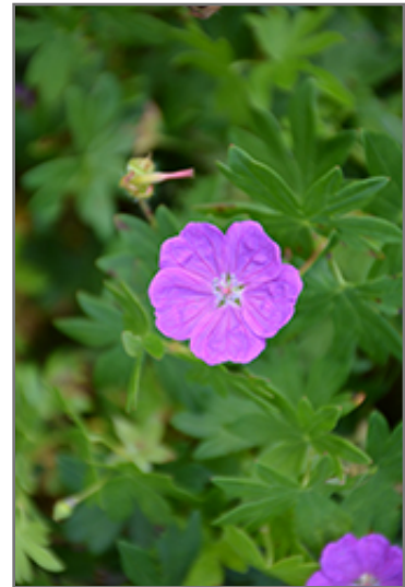
New Hampshire Purple Cranesbill flowers

* This is a 'special order' plant - contact store for details