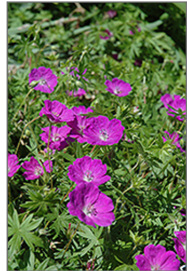
New Hampshire Purple Cranesbill flowers

This is a relatively low maintenance plant, and should only be pruned after flowering to avoid removing any of the current season's flowers. Deer don't particularly care for this plant and will usually leave it alone in favor of tastier treats. It has no significant negative characteristics.