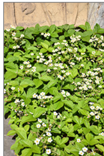
Common Wild Strawberry in bloom

Common Wild Strawberry features dainty white cup-shaped flowers with yellow eyes along the stems from late spring to early summer. Its attractive tomentose round compound leaves remain green in color throughout the season. It features an abundance of magnificent cherry red berries from late spring to late summer.