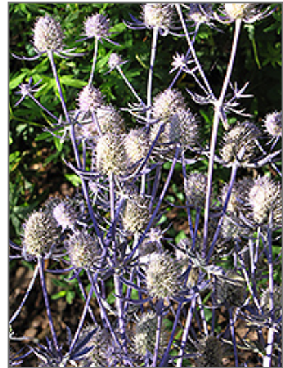
Jade Frost Variegated Sea Holly flowers

Jade Frost Variegated Sea Holly will grow to be about 8 inches tall at maturity extending to 24 inches tall with the flowers, with a spread of 15 inches. When grown in masses or used as a bedding plant, individual plants should be spaced approximately 12 inches apart. Its foliage tends to remain low and dense right to the ground. It grows at a medium rate, and under ideal conditions can be expected to live for approximately 10 years. As an herbaceous perennial, this plant will usually die back to the crown each winter, and will regrow from the base each spring. Be careful not to disturb the crown in late winter when it may not be readily seen!