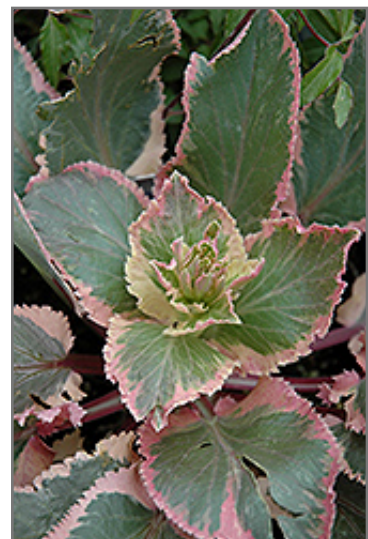
Jade Frost Variegated Sea Holly foliage