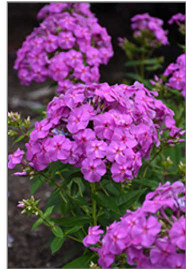
Flame Lilac Garden Phlox flowers

Flame Lilac Garden Phlox is recommended for the following landscape applications;