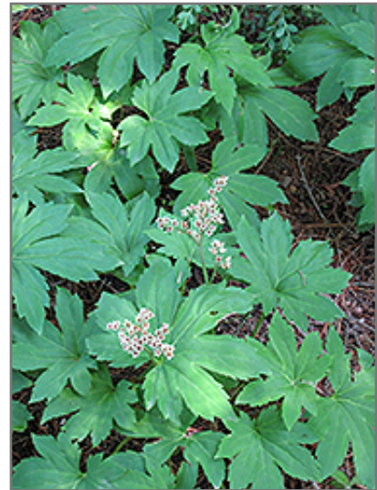
Crimson Fans Mukdenia flowers

* This is a 'special order' plant - contact store for details