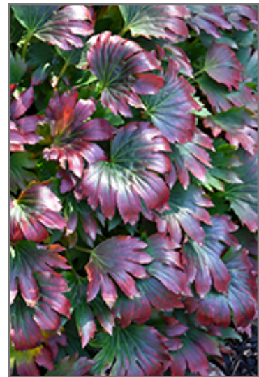
Crimson Fans Mukdenia foliage

Crimson Fans Mukdenia is recommended for the following landscape applications;