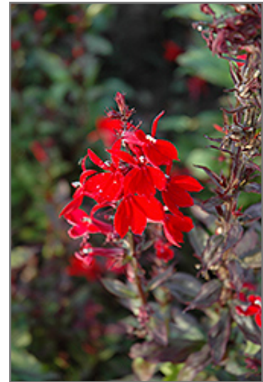
Queen Victoria Lobelia flowers