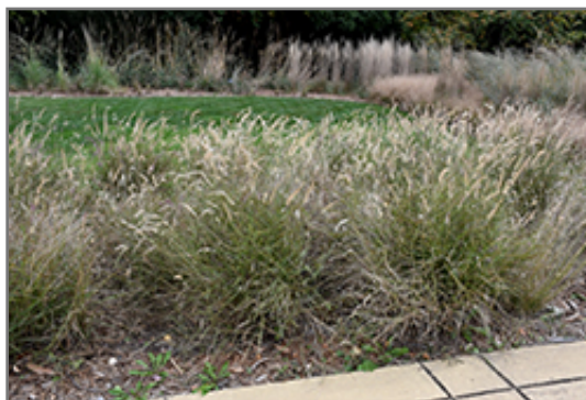
Karley Rose Oriental Fountain Grass fruit