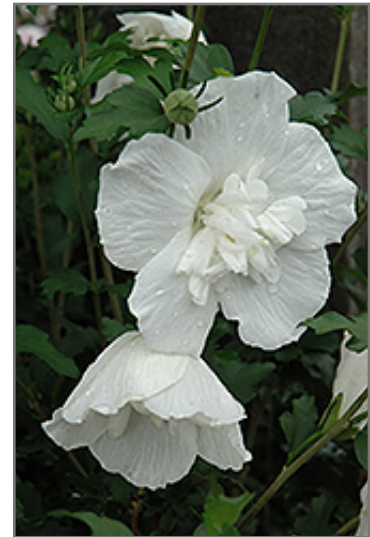
White Chiffon Rose of Sharon flowers

White Chiffon Rose of Sharon is recommended for the following landscape applications;