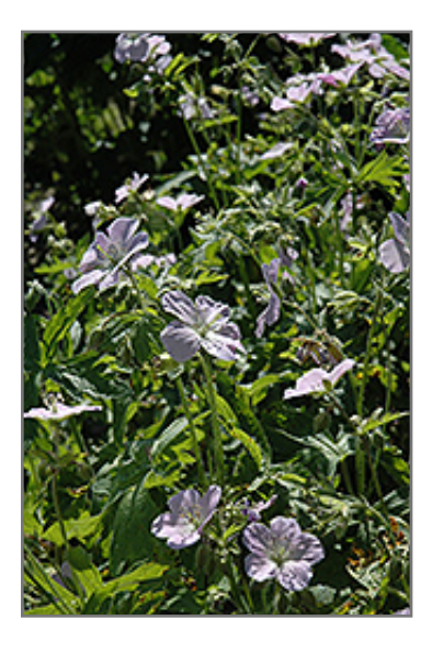
Chatto Wild Cranesbill flowers

Large, coarse, dark-green leaves with deep veins provide interesting texture; this mounded plant is bathed in pale pink saucer shaped blooms; deadhead spent flowers for reblooming later in the season