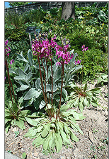
Aphrodite Shooting Star in bloom

BRUNSWICK 422 Bath Road Brunswick, ME 04011 1-800-339-8111 207-442-8111