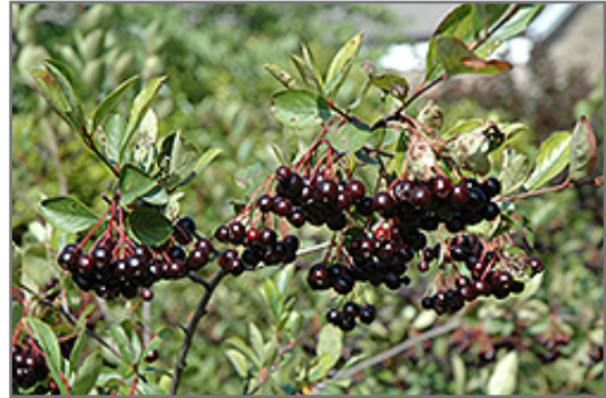
Autumn Magic Black Chokeberry fruit

This shrub should only be grown in full sunlight. It is an amazingly adaptable plant, tolerating both dry conditions and even some standing water. It is not particular as to soil type or pH, and is able to handle environmental salt. It is somewhat tolerant of urban pollution. This is a selection of a native North American species.