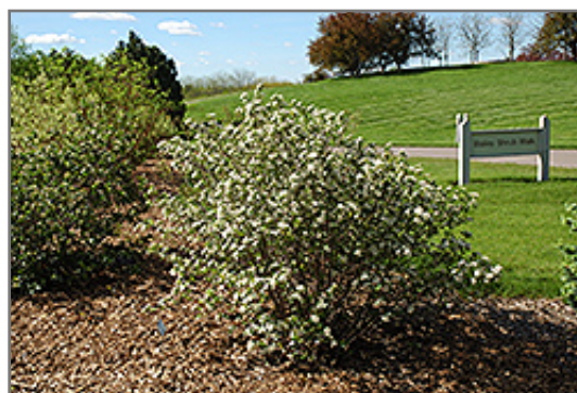
Autumn Magic Black Chokeberry in bloom