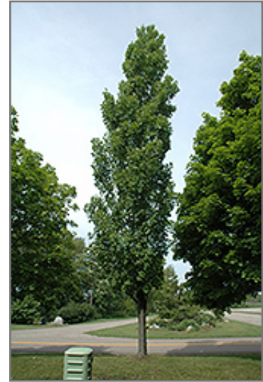
Armstrong Maple