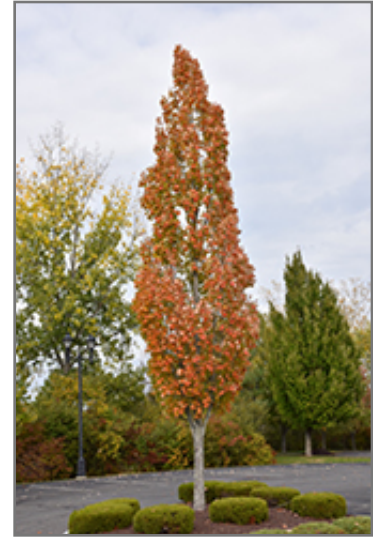
Armstrong Maple in fall

This tree should only be grown in full sunlight. It is quite adaptable, preferring to grow in average to wet conditions, and will even tolerate some standing water. It is not particular as to soil type or pH. It is highly tolerant of urban pollution and will even thrive in inner city environments. This particular variety is an interspecific hybrid.