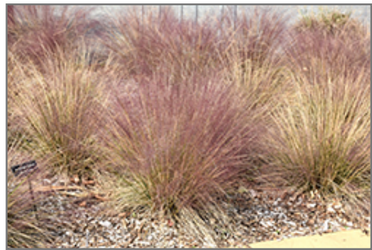
Hairawn Muhly in fall

BRUNSWICK 422 Bath Road Brunswick, ME 04011 1-800-339-8111 207-442-8111