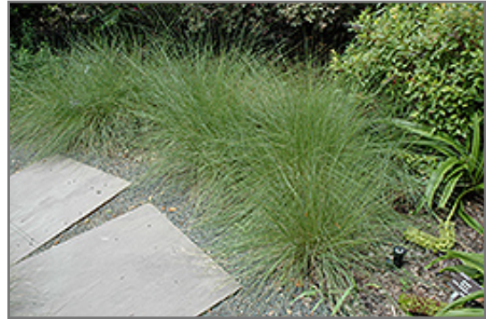
Hairawn Muhly

Hairawn Muhly is recommended for the following landscape applications;