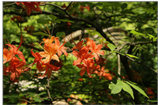
Flame Azalea flowers

BRUNSWICK 422 Bath Road Brunswick, ME 04011 1-800-339-8111 207-442-8111