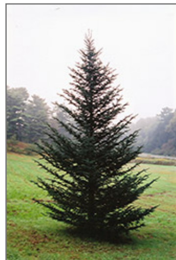
Fraser Fir

Fraser Fir will grow to be about 35 feet tall at maturity, with a spread of 20 feet. It has a low canopy, and should not be planted underneath power lines. It grows at a slow rate, and under ideal conditions can be expected to live for 70 years or more.