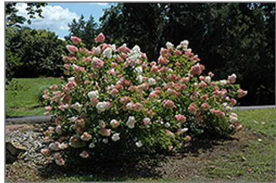
Vanilla Strawberry Hydrangea in bloom