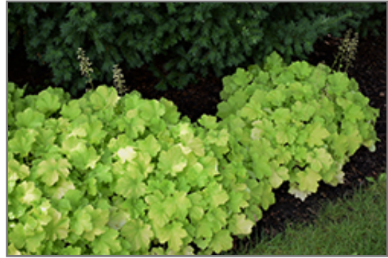
Citronelle Coral Bells in bloom

Citronelle Coral Bells will grow to be only 6 inches tall at maturity extending to 12 inches tall with the flowers, with a spread of 15 inches. When grown in masses or used as a bedding plant, individual plants should be spaced approximately 12 inches apart. Its foliage tends to remain low and dense right to the ground. It grows at a medium rate, and under ideal conditions can be expected to live for approximately 10 years. As an evergreen perennial, this plant will typically keep its form and foliage year-round.