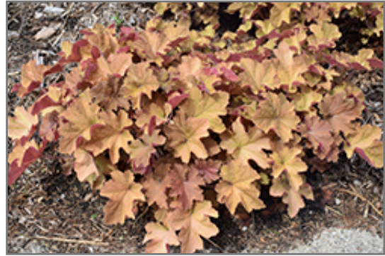
Caramel Coral Bells

Caramel Coral Bells will grow to be about 10 inches tall at maturity extending to 18 inches tall with the flowers, with a spread of 18 inches. When grown in masses or used as a bedding plant, individual plants should be spaced approximately 15 inches apart. Its foliage tends to remain low and dense right to the ground. It grows at a medium rate, and under ideal conditions can be expected to live for approximately 10 years. As an evergreen perennial, this plant will typically keep its form and foliage year-round.