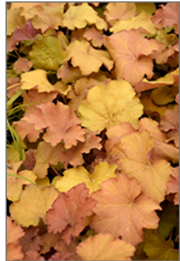
Caramel Coral Bells foliage

Caramel Coral Bells is recommended for the following landscape applications;