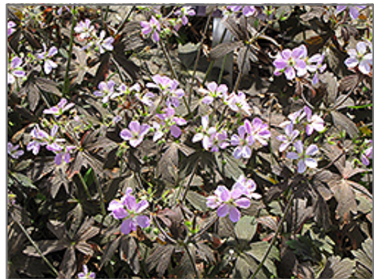
Espresso Cranesbill flowers

BRUNSWICK 422 Bath Road Brunswick, ME 04011 1-800-339-8111 207-442-8111