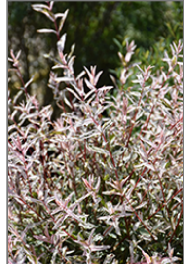
Tricolor Willow foliage

This shrub should only be grown in full sunlight. It is quite adaptable, preferring to grow in average to wet conditions, and will even tolerate some standing water. It is not particular as to soil type or pH. It is highly tolerant of urban pollution and will even thrive in inner city environments. This is a selected variety of a species not originally from North America.