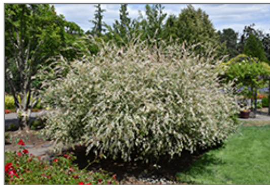
Tricolor Willow

BRUNSWICK 422 Bath Road Brunswick, ME 04011 1-800-339-8111 207-442-8111