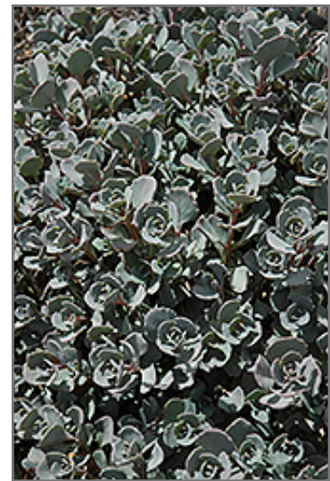
Lidakense Stonecrop foliage

BRUNSWICK 422 Bath Road Brunswick, ME 04011 1-800-339-8111 207-442-8111