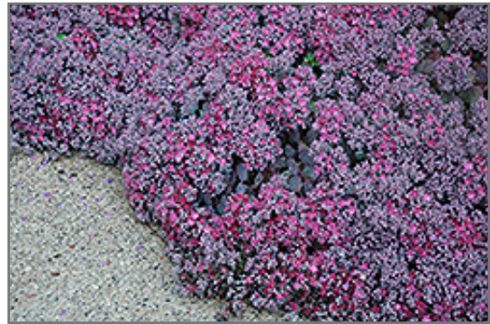
Lidakense Stonecrop in bloom