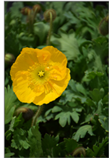
Champagne Bubbles Yellow Poppy flowers

Champagne Bubbles Yellow Poppy is an open herbaceous perennial with tall flower stalks held atop a low mound of foliage. It brings an extremely fine and delicate texture to the garden composition and should be used to full effect.