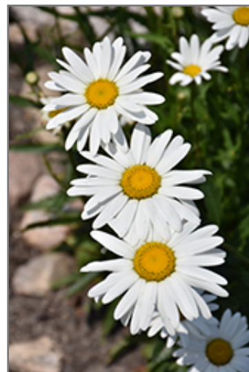
Silver Princess Shasta Daisy flowers