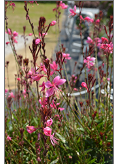
Steffi Dark Rose Gaura flowers

Steffi Dark Rose Gaura is recommended for the following landscape applications;