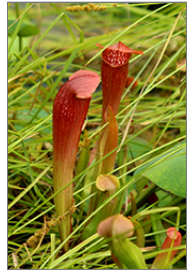
Bug Bat Pitcher Plant