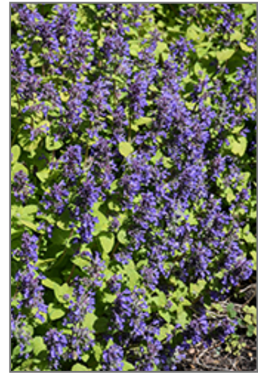
Chartreuse On The Loose Catmint flowers

BRUNSWICK 422 Bath Road Brunswick, ME 04011 1-800-339-8111 207-442-8111