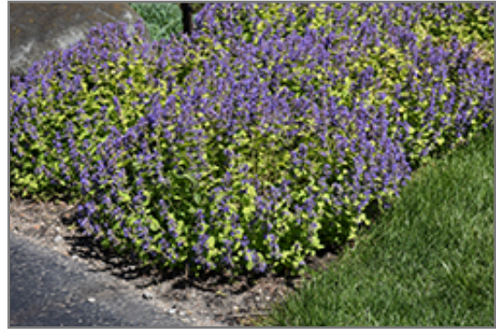
Chartreuse On The Loose Catmint in bloom