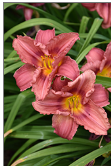
Happy Ever Appster Rosy Returns Daylily flowers

This is a relatively low maintenance plant, and is best cleaned up in early spring before it resumes active growth for the season. It is a good choice for attracting butterflies to your yard. It has no significant negative characteristics.