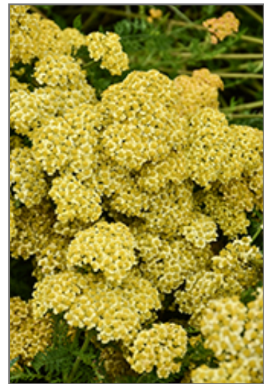
Milly Rock Yellow Terracotta Yarrow flowers