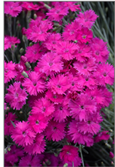
Neon Star Pinks flowers

CUMBERLAND 201 Gray Rd (Route 100) Cumberland, ME 04021 1-800-348-8498 207-829-5619