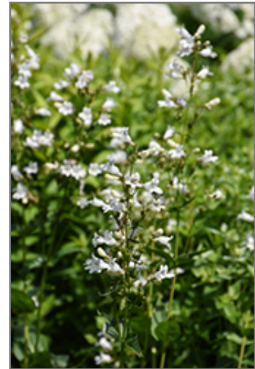
Foxglove Beardtongue flowers

Foxglove Beardtongue is recommended for the following landscape applications;