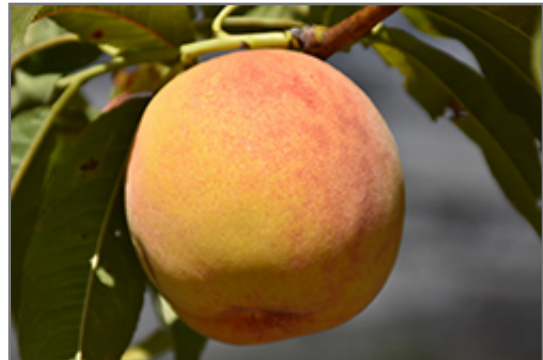
Reliance Peach fruit

Reliance Peach is clothed in stunning clusters of fragrant pink flowers along the branches in early spring, which emerge from distinctive rose flower buds before the leaves. It has dark green deciduous foliage. The narrow leaves turn yellow in fall. The fruits are showy yellow drupes with a red blush, which are carried in abundance in mid summer. The fruit can be messy if allowed to drop on the lawn or walkways, and may require occasional clean-up.