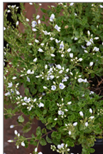
Snowmass Blue-Eyed Veronica flowers

Snowmass Blue-Eyed Veronica is recommended for the following landscape applications;