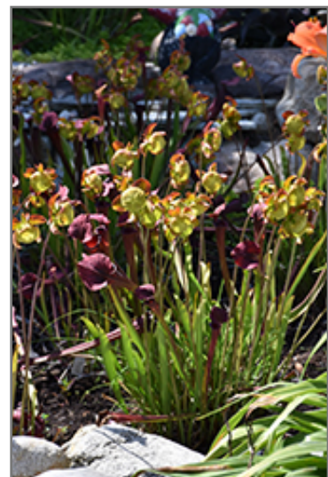
Conversation Piece Pitcher Plant in bloom