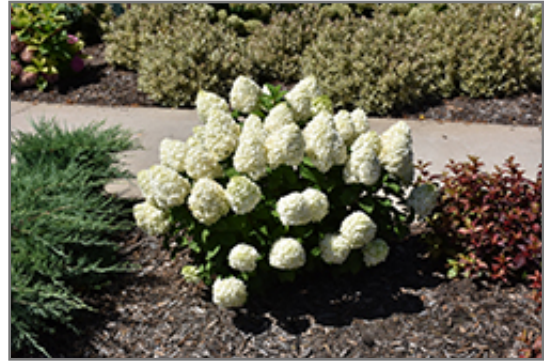
Little Lime Punch Hydrangea in bloom

Little Lime Punch Hydrangea makes a fine choice for the outdoor landscape, but it is also well-suited for use in outdoor pots and containers. With its upright habit of growth, it is best suited for use as a 'thriller' in the 'spiller-thriller-filler' container combination; plant it near the center of the pot, surrounded by smaller plants and those that spill over the edges. It is even sizeable enough that it can be grown alone in a suitable container. Note that when grown in a container, it may not perform exactly as indicated on the tag - this is to be expected. Also note that when growing plants in outdoor containers and baskets, they may require more frequent waterings than they would in the yard or garden.