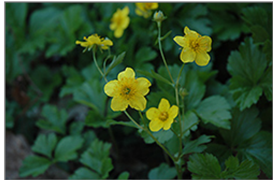
Barren Strawberry flowers