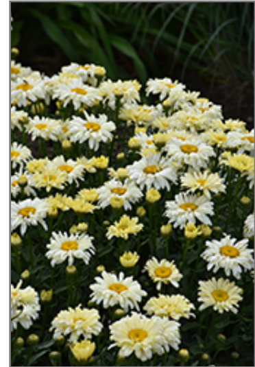
Amazing Daisies Banana Cream II Shasta Daisy flowers

* This is a 'special order' plant - contact store for details