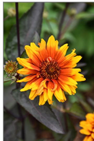
Summer Eclipse False Sunflower flowers

This is a relatively low maintenance plant, and is best cleaned up in early spring before it resumes active growth for the season. It is a good choice for attracting butterflies to your yard. It has no significant negative characteristics.