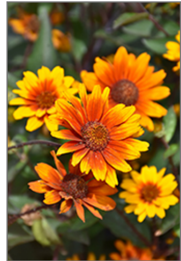
Summer Eclipse False Sunflower flowers

This plant does best in full sun to partial shade. It is very adaptable to both dry and moist locations, and should do just fine under typical garden conditions. It is not particular as to soil type or pH. It is highly tolerant of urban pollution and will even thrive in inner city environments. This is a selection of a native North American species. It can be propagated by division; however, as a cultivated variety, be aware that it may be subject to certain restrictions or prohibitions on propagation.